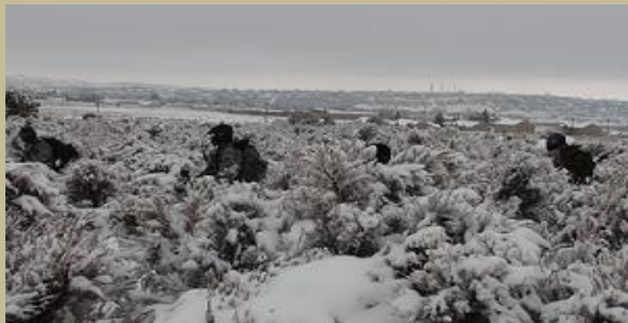
SUU Cadets try to blend in the thick snow at an early tactics lab this semester.