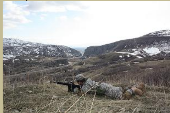
CDT Smith (BYU) holds security while on Patrol in Provo Canyon.