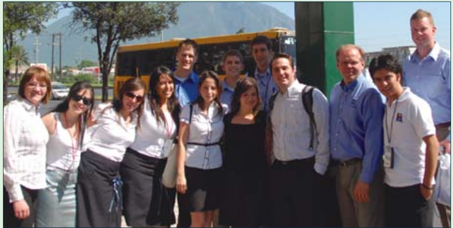
Students and faculty from BYU and Monterrey Tech pause for a picture after eating at El Rey Del Cabrito in Monterrey.

The BYU students participated in the conference and met with faculty, administrators, and students of Monterrey Tech to discuss the petitioning process for Beta Alpha Psi and determine how the BYU chapter could best act as a mentor