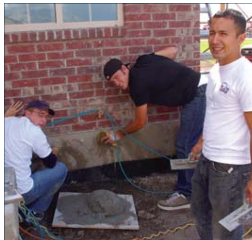
BAP members working hard for Habitat for Humanity.

Meet the Interns event at the BYU Conference Center. More than one hundred interns attended, representing a variety of accounting and finance firms from locations across the nation. More than three hundred students interested in learning more about internships with a certain company or in a certain city were able to network with fellow students who had completed