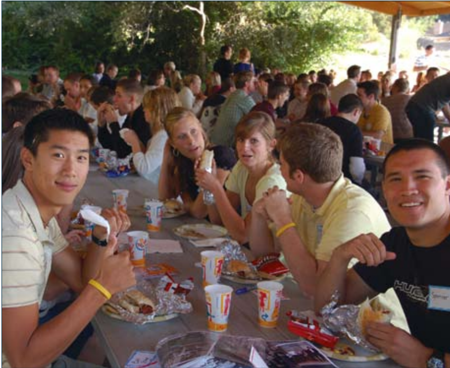
Students meet and mingle at the Junior Core Opening Social.

Beta Alpha Psi got off to an early start by welcoming incoming Junior Core students at an opening social barbeque the day before classes started fall semester. Two-hundred fifty students turned out to the event to learn more about Beta Alpha Psi and mingle with BAP members who had been through the infamous Junior Core experience.